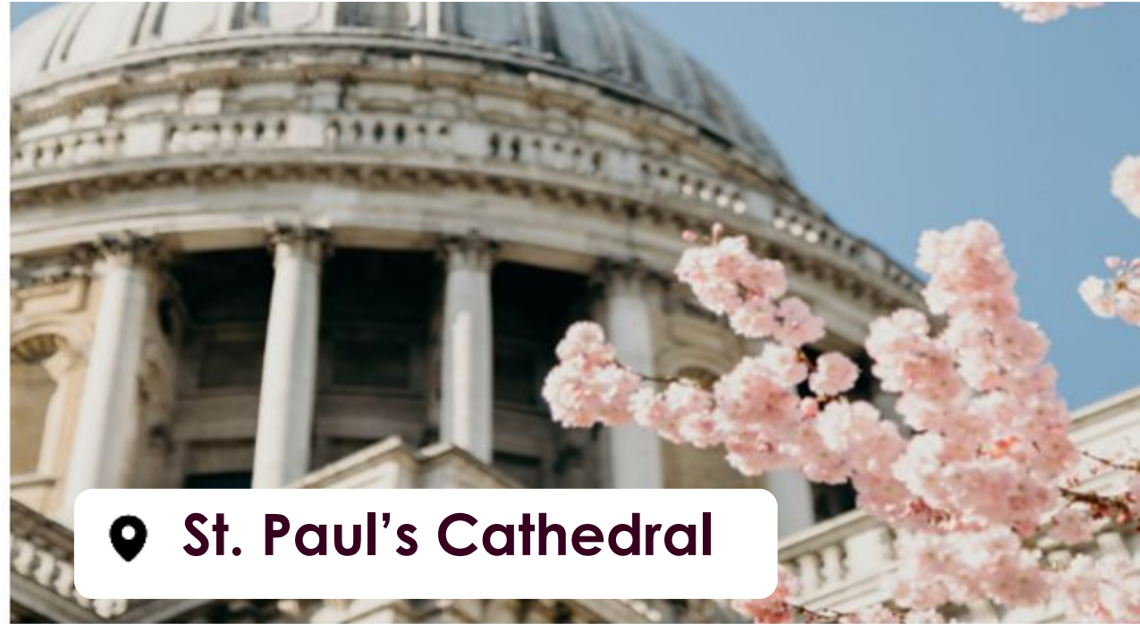
📍 St. Paul's Cathedral