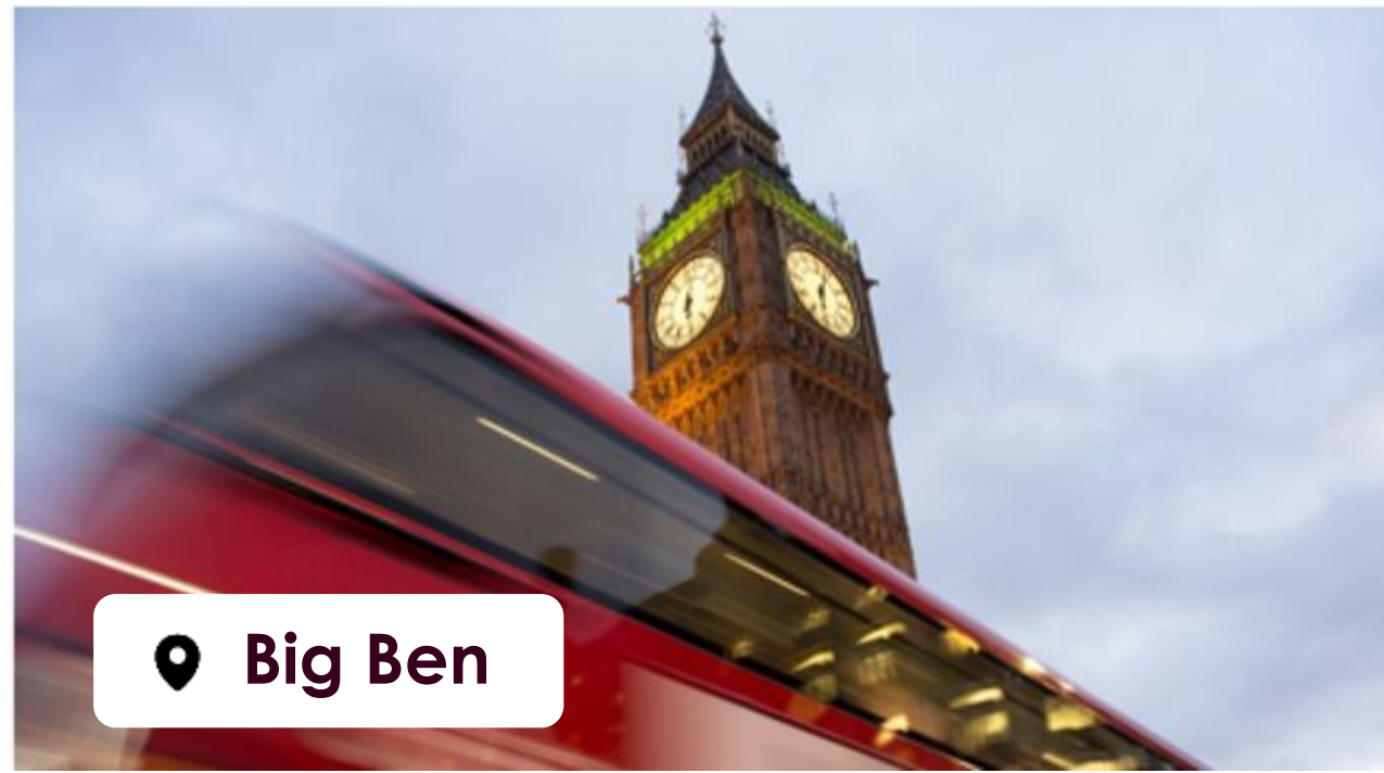
📍 Big Ben