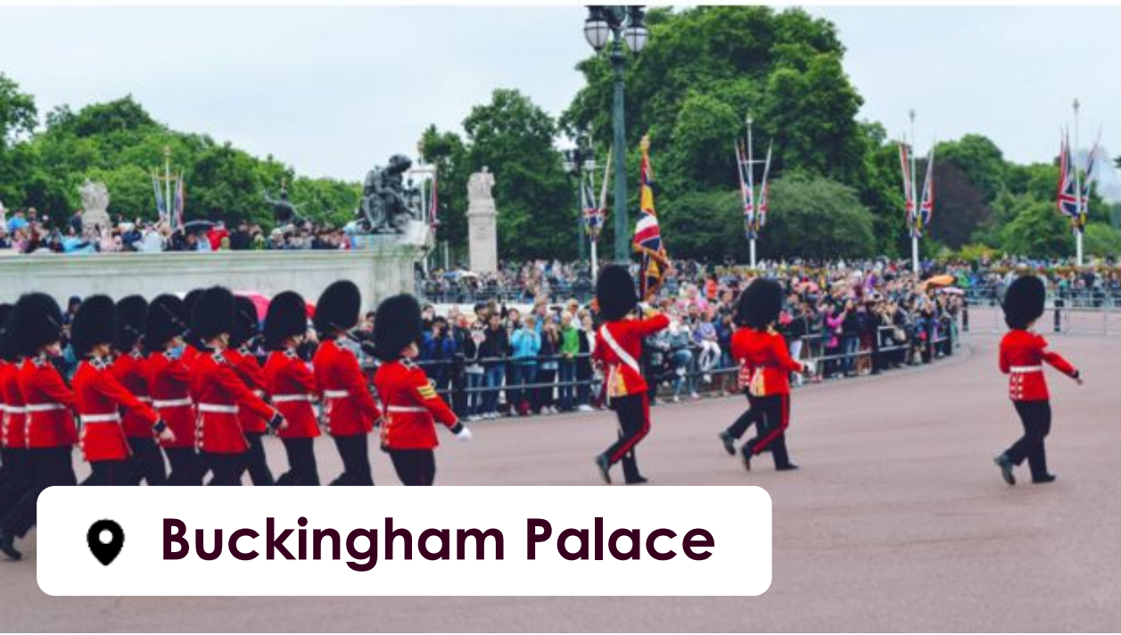
📍 Buckingham Palace